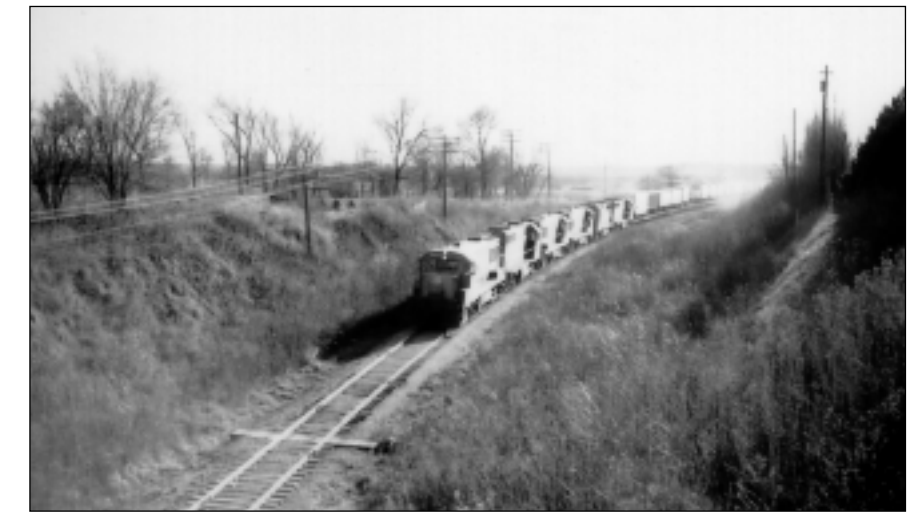
Northbound train as seen from the 33rd and Sheridan Overpass, December 1967.

The Rock Island bike path, which runs along the eastern edge of our neighborhood, was constructed in the early 1980s. However, its genesis actually occurred a hundred years earlier.