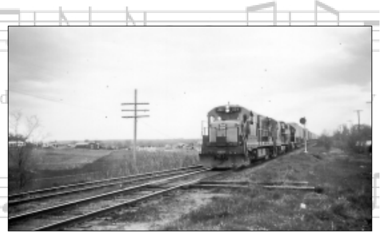
Rock Island 231, northbound train at Calvert Street. May 1969. (The area at the left is the future site of Rousseau Elementary School.)

Oh the Rock Island Line is a mighty fine line Oh the Rock Island Line is the road to ride Oh the Rock Island Line is a mighty fine line If you want to ride, you gotta ride it like you're flyin' Get your ticket at the station on the Rock Island Line