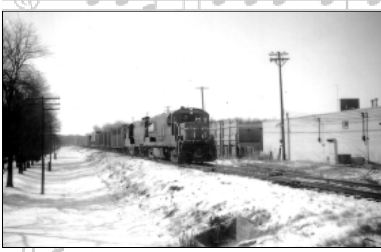
Rock Island 204, northbound behind Leon's grocery store, March 1970.