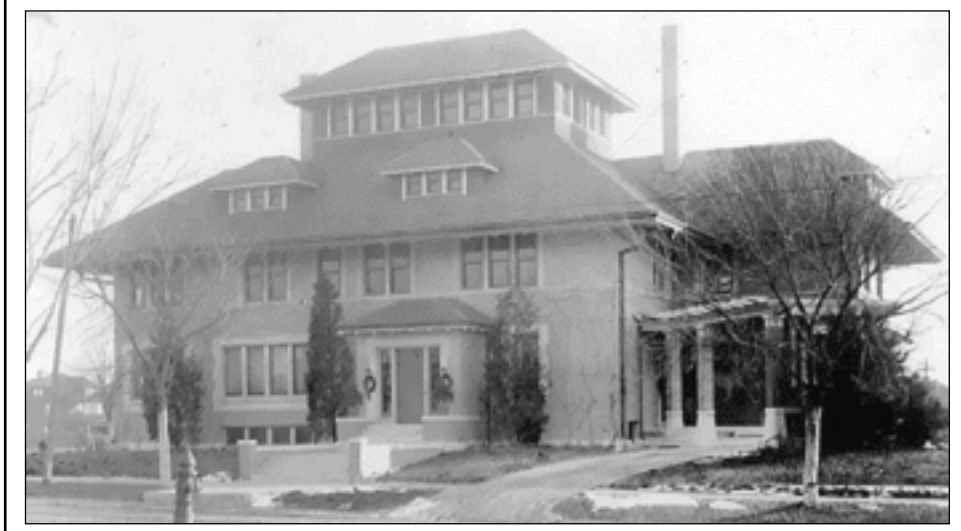
The Mark Woods house shortly after its completion in 1911.

ow does the residence of a prominent Lincoln businessman at 2101 Sheridan Boulevard evolve into a residential drug and alcohol treatment center at 2501 South Street? That is the story behind the past and present incarnations of the Mark Woods home at the corner of Sheridan and South streets.