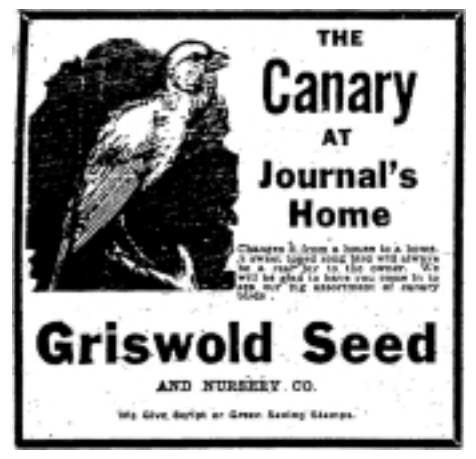
This 1925 ad extolled the virtures of having a 'sweet toned song bird' in the Ideal Home.

article stated that "concrete masonry was selected for the structural frame work and walls of the Ideal Home with an exterior of Portland cement sheen." Cinder block technology, which combined coal cinders and concrete, had been invented ten years prior to the building of the Ideal Home. The cinder blocks weighed about 75% less than ordinary concrete blocks and were used extensively in the walls above grade. They provided the desired flame resistance as well as excellent insulation and water resistance.