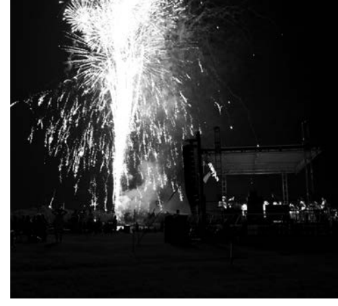
Trinkle Brass Works at the Uncle Sam Jam